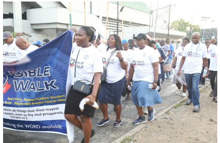
A cross section of BSN staff during the Bible walk