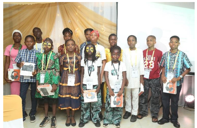
Children of staff members who took part in the Bible recitation competition with their prizes

As usual, some deserving staff members were rewarded, while all the departments presented thanksgiving items for donation to orphanages.