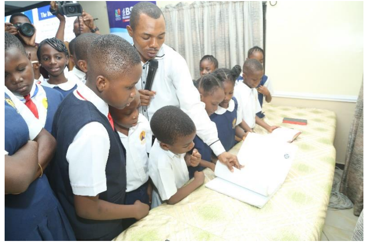
Pupils of Greatdestination Primary School viewing the items at the Bible Exhibition during the BSN @ 60 anniversary