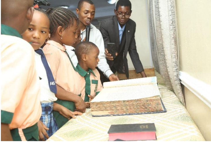
Pupils of Hephzibah Primary School viewing the items at the Bible Exhibition during the BSN @ 60 anniversary