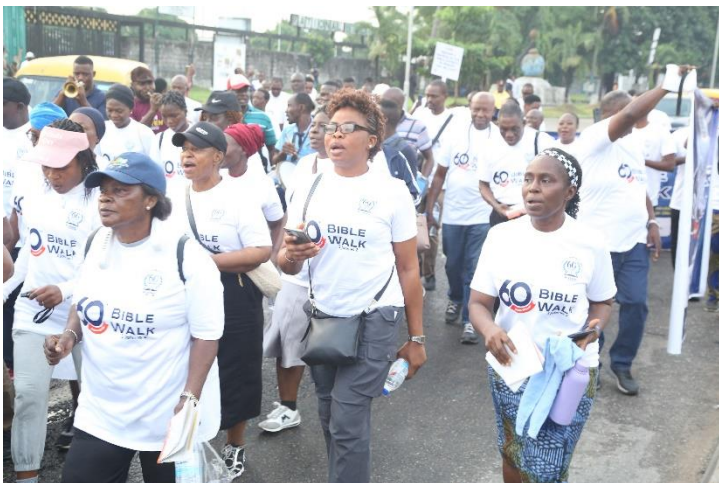
A cross section of participants at the BSN @ 60 Bible walk