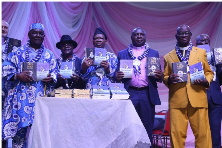
Gen Dr Yakubu Gowon with others displaying a commemorative Bible and a book unveiled at the BSN 60th anniversary Founder's Day Lecture