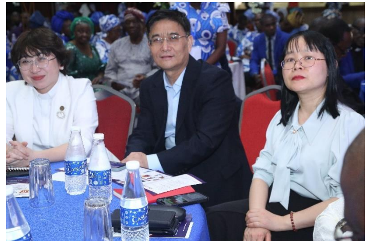
The team from Amity Printing Company, China at the BSN Founder's Day Lecture