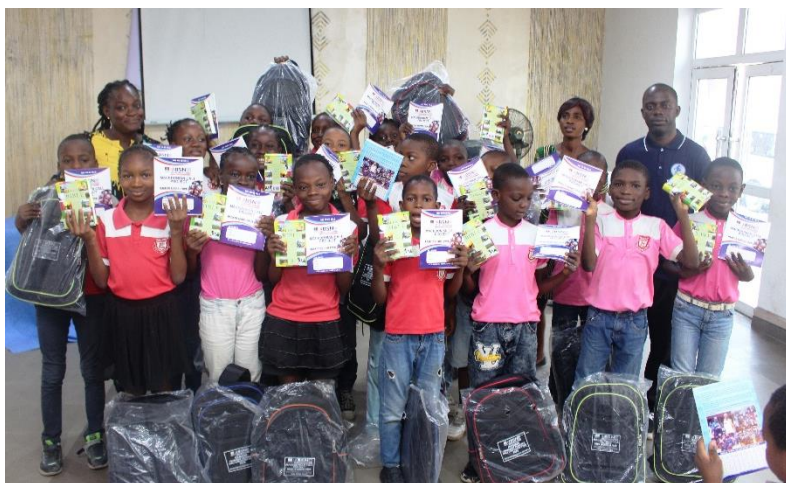
A section of pupils of The Red Cross Primary and Nursery School with the items received from BSN

The Macedonian Call, which commenced in 2018, is one of BSN's key intervention programmes. This project has benefited over 40, 000 people in over 18 Internally Displaced People's Camps in Abuja, Adamawa, Taraba, Edo, and Benue States.