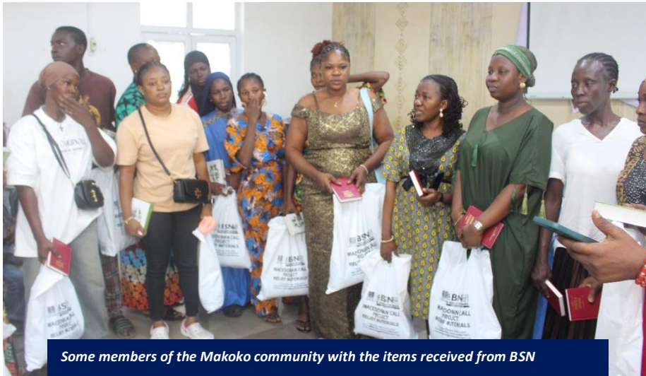
Some members of the Makoko community with the items received from BSN

To alleviate the impact of the current economic challenges on families, The Bible Society of Nigeria (BSN) has donated educational materials to the pupils of the Nigerian Red Cross Nursery and Primary School in Makoko, Lagos, as well as foodstuffs to 70 households in the community worth ₦5.2 million.