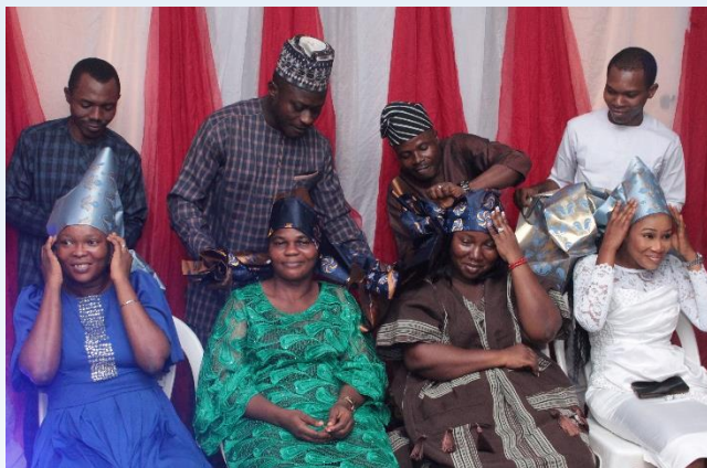
Some of the BSN staff struggling to tie headgear for their wives

One of the most exciting parts of the party was the couples' game, where four male staff members were asked to tie headgear for their wives. They all struggled to do this, causing spontaneous and prolonged laughter, as none of them could do it effectively.