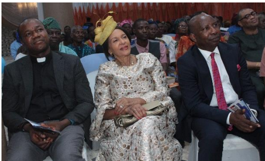
A cross section of guests at the Founder's Day