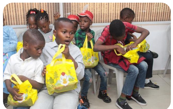
Some of the children of staff at the End of the Year party