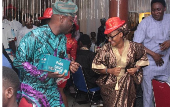
Some of the staff during thanksgiving at the End of the Year party