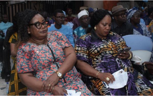
A section of guests at the Founder's Day