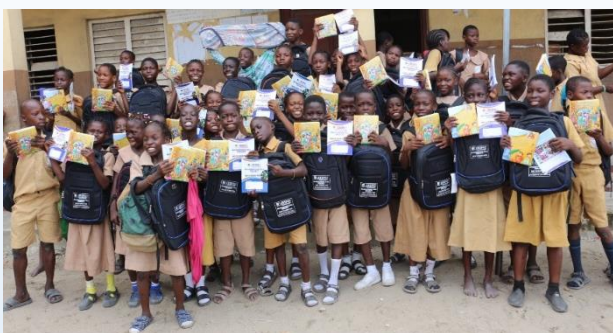
A cross section of the pupils with their bags and writing materials

The Bible Society of Nigeria (BSN) has donated Bibles, relief materials, and back-to-school packs worth ₦2,124,864 to the pupils and parents of Local Government Authority Primary School 1 & 2, at Ogbonwankwo Street in Ajegunle, Lagos State. The Society carried out the donation through its Macedonian Call project.