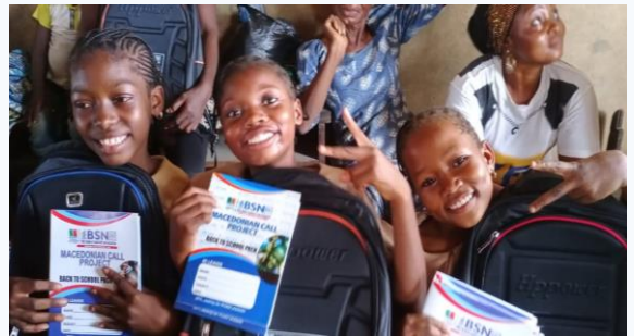
Some of the pupils with their back-to-school packs

Meanwhile, the National Secondary Bible quiz, which used to be oral, would henceforth be a written exercise.