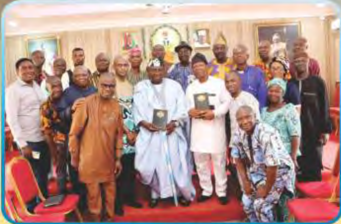
Group picture with HRM Oba Solomon Owoniyi, the Obaro of Kabba (m) during a courtesy visit to his palace