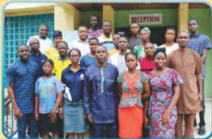
Group photo of the participants of the National Bible Competition organised by the BSN in Lagos