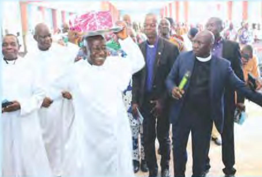
Elated clergymen in Okun land ushered in the first Okun Bible at the dedication ceremony in Aiyetoro-Gbede, Kogi State.

D ancing, shouts of joy, and praises to God characterised the dedication of the Okun Bible as speakers of the language came out in their hundreds to receive the Bible.