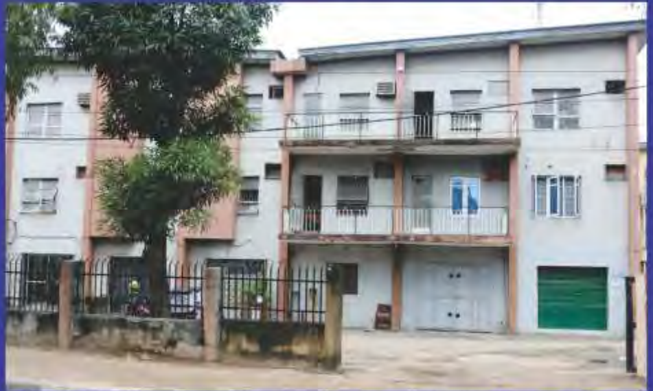
The recently acquired property by the BSN located at 202/204, Ikorodu Road, Palmgrove, Lagos.