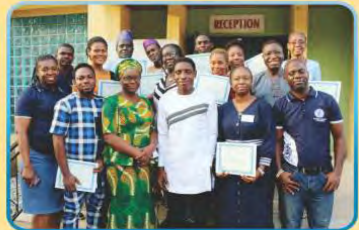
Participants and facilitators at the advance trauma healing training held recently in Lagos