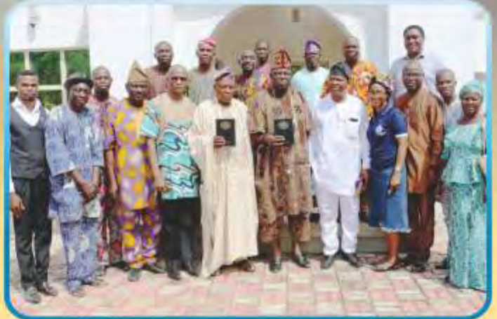
Group photo with HRM Oba Olusegun Ayeni, the Oliki of Ijumu (6th right) during a courtesy visit to his palace