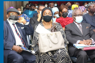
Cross section of guests at the event