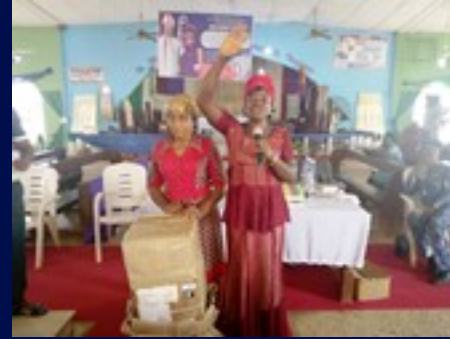
Another set of beneficiaries receive their Braille Bible in Imo State