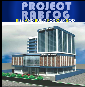
Prototype of proposed Bible House